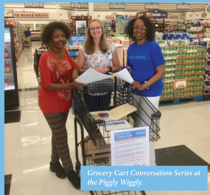
Grocery Cart Conversation Series at the Piggly Wiggly.

A free community nutrition education program led by registered dietitians was initiated with ongoing monthly sessions at the Piggly Wiggly in Kinston.