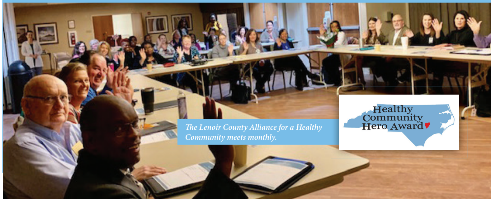
The Lenoir County Alliance for a Healthy Community meets monthly.