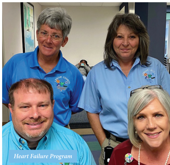
Heart Failure Program

factor management, and assistance in accessing community resources for the patient and their caregiver is provided. The patient is also offered a community paramedic home visit free of charge. In 2019, over 100 patients were enrolled in the COMPASS program at UNC Lenoir Health Care.